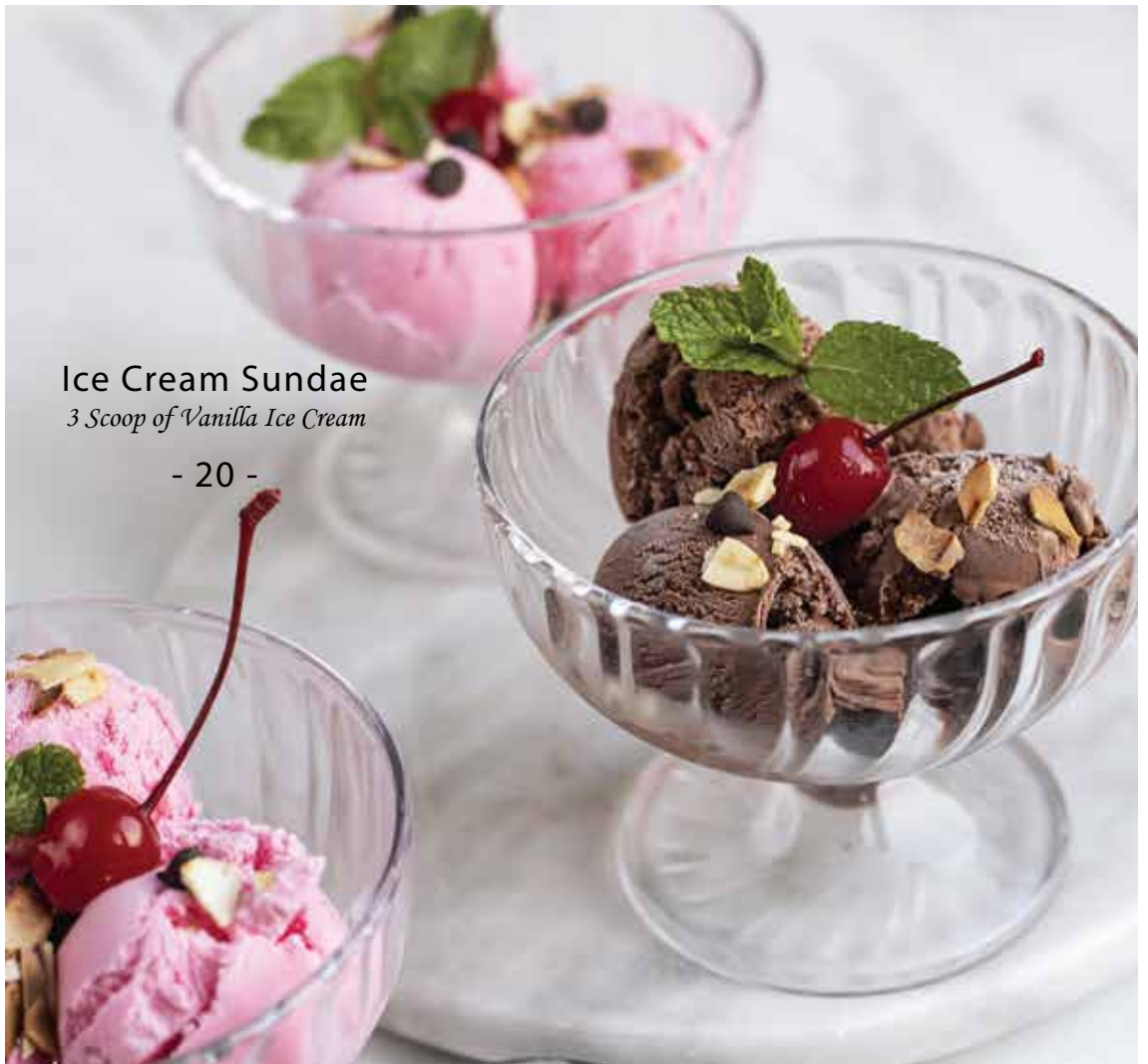
Ice Cream Sundae